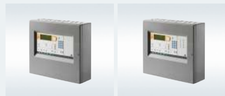
FC361-ZZ Order no.: S54433-C112-A1 FC361-YZ Order no.: S54433-C110-A1