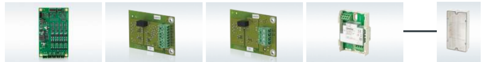
Output card (4M) FCA3602-Z1 – 4 configurable monitored outputs (24 VDC) – Output current per output: 1.0 A – Max. current of output card: 2.0 A Order no.: S54433-A114-A1 RS232 module (isolated) FCA2001-A1 – Communication module for peripheral devices with RS232 interface (e.g., event printer DL3750+) Order no.: A5Q00005327 RS485 module (isolated) FCA2002-A1 – Communication module for peripheral devices with RS485 interface Order no.: A5Q00009923 Output module (230V) FCA1209-Z1 – 1 output with potential-free relay contacts – Control of fire ventilation, air conditioning, elevators, doors, control installations, etc. – Operating current (quiescent): max. 0.1 mA – Relay output (ohm): 230 VAC, max. 5 A/30 VDC, max. 5 A Order no.: S54400-B124-A1 Housing FDCH221 IP65 Order no.: S54312-F3-A1

Note: Unit can be powered from the integral power supply or from an additional external power supply.