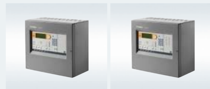
FC361-ZA Order no.: S54433-C111-A1 FC361-YA Order no.: S54433-C109-A1